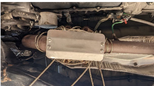
Figure 2 - Completed Install

FOR ADDITIONAL ASSISTANCE, CHECK OUT OUR INSTALLATION VIDEOS ON WWW.POPANDLOCK.NET