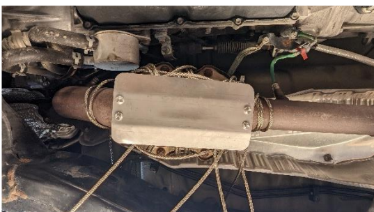
Figure 2 - Completed Install

FOR ADDITIONAL ASSISTANCE, CHECK OUT OUR INSTALLATION VIDEOS ON WWW.FREIGHTDEFENSE.COM