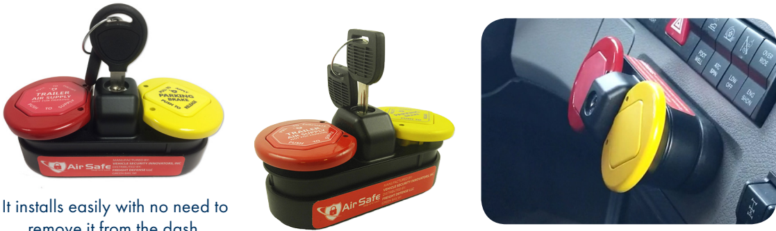
It installs easily with no need to remove it from the dash.