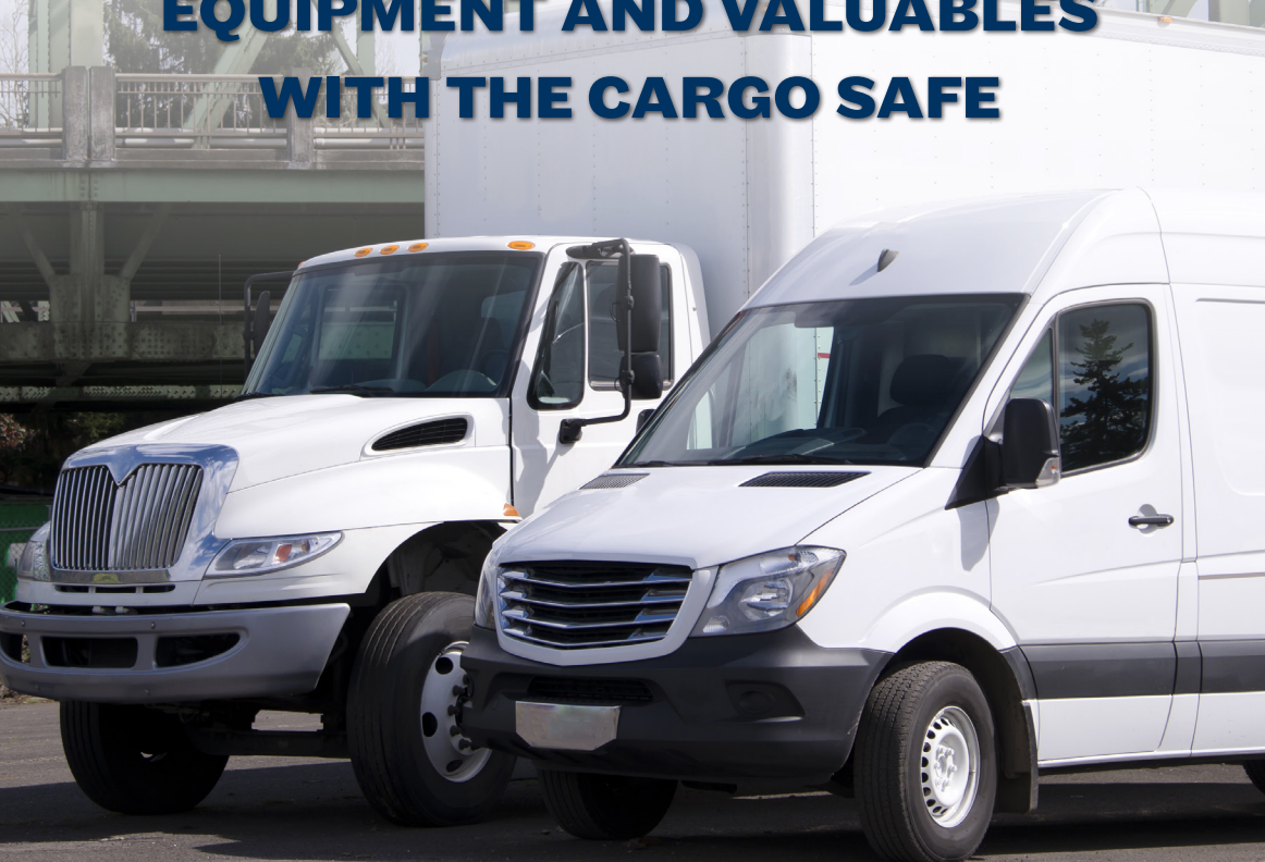
ROLL-UP DOOR TRUCK