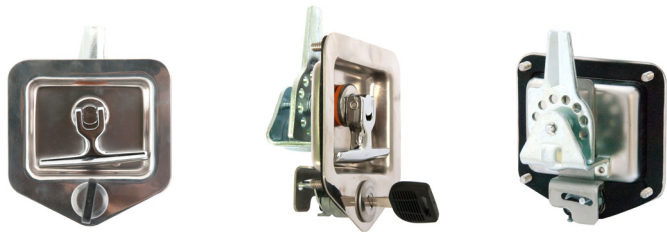
Security simplified. The One-Key T® handle uses your vehicle’s ignition key to secure your storage.

One-Key T® is designed for use with compartment doors, tool and battery boxes. This industry standard, stainless steel latch includes an automotive-grade lock with a weather resistant shutter, providing superior performance and corrosion resistance. This handle can be coded to match your truck’s ignition key.